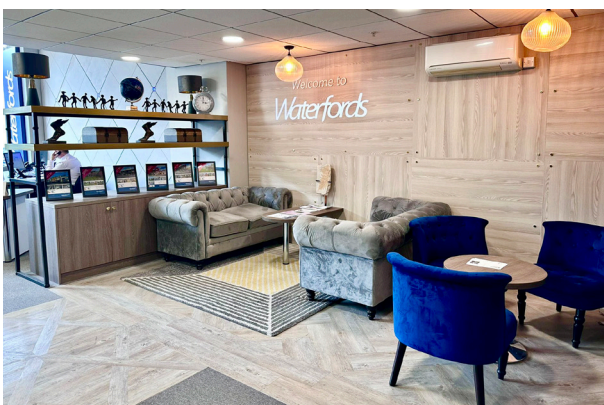
FLEET LETTINGS & PROPERTY MANAGEMENT